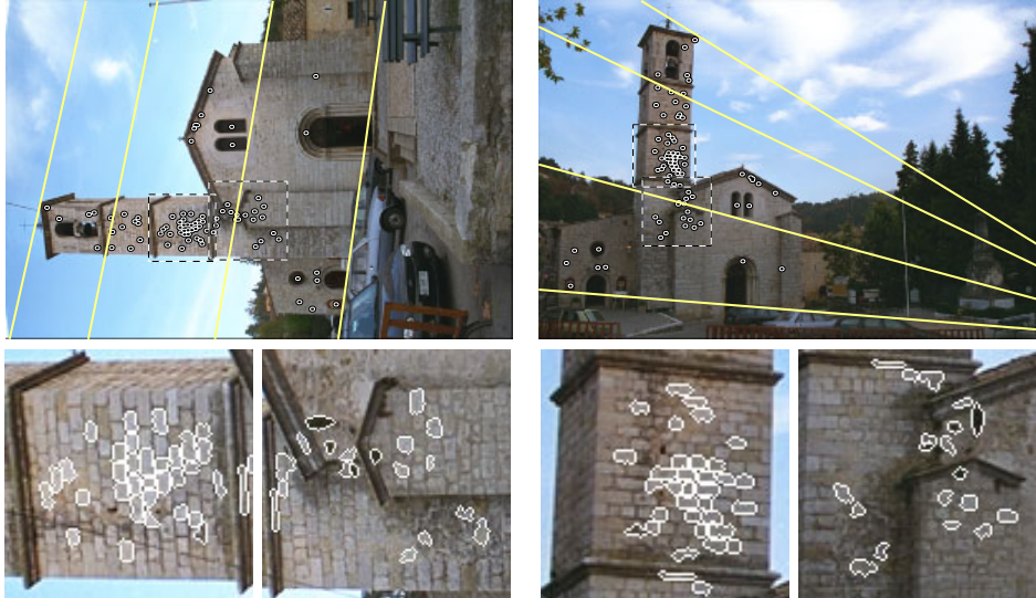
Figure 2: VALBONNE: Estimated epipolar geometry and points associated to the matched regions are shown in the first row. Cutouts in the second row show matched bricks.

image since the rest of the scene is not visible in the second view. Different resolution of detected features is evident in the close-up. Valbonne , (Fig. 2). This outdoor scene has been analysed in the literature [10, 9]. Repetitive patterns such as bricks are present. The part of the scene visible in both views covers a small fraction of the image.