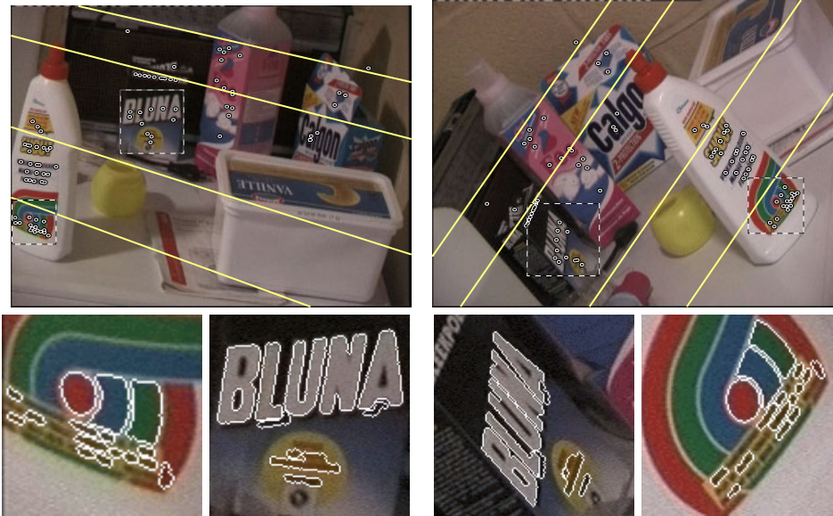
Figure 3: WASH: Epipolar geometry and dense matched regions with fully affine distortion.