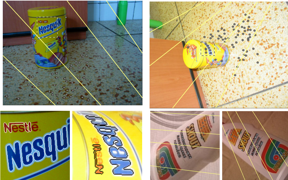
Figure 5: CYLINDRICAL BOX: Epipolar geometry (top) and matched regions (bottom left). Fully affine distortion, a non-planar object, textured surface and a strong specular reflection are present in the scene. SHOUT (bottom right), a scene with a change of illumination spectral power distribution.