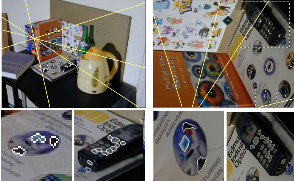
Figure 1: BOOKSHELF: Estimated epipolar geometry on indoor scene with significant scale change. In the cutouts the change in the resolution of detected DRs is clearly visible.

Tentative correspondences using correlation. Invariant description is used as a preliminary test. The final selection of tentative correspondences is based on correlation. First transformations that diagonalise the covariance matrix of the DRs are applied. The resulting circular regions are correlated (for all relative rotations). This procedure is done efficiently in polar coordinates for different sizes of circles.