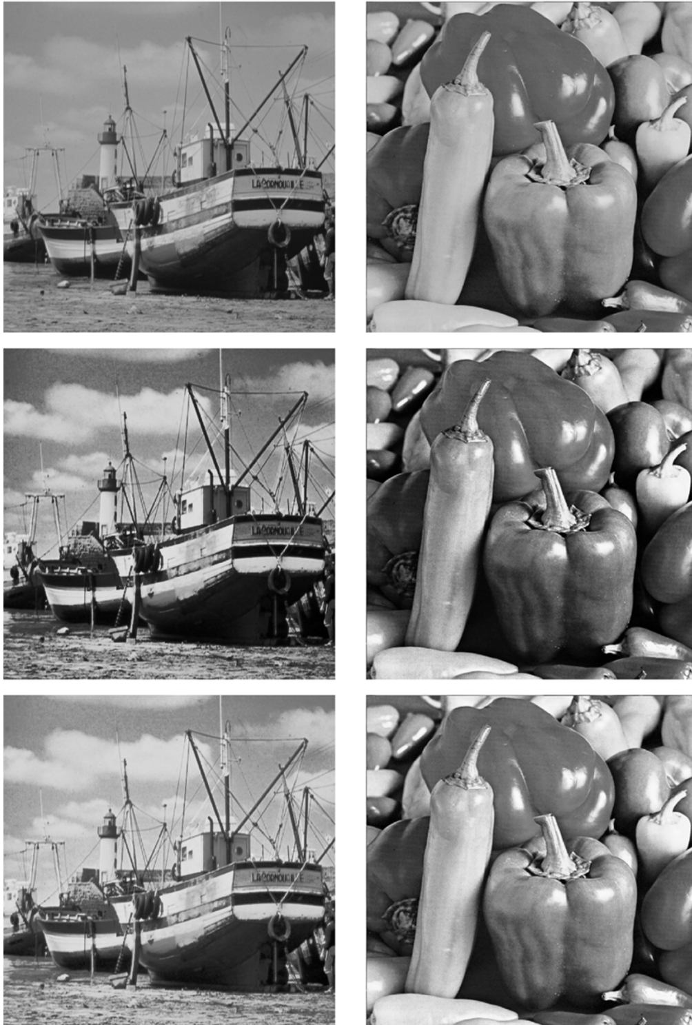
Fig. 5. Color images exact histogram specification: (top) original, (middle) logarithmic, and (bottom) linear.

to process only the luminance component. Such color spaces are so-called television color spaces ( YUV , YIQ , YC_aC_b ), perceptual color spaces (HSI, CIELAB), etc., [17]. Let HSI (hue, saturation, intensity) be such a color space. Since images are generally represented in RGB color space, exact histogram specification is addressed by: i) conversion from RGB to the HSI, ii) ordering, iii) exact histogram specification performed on the I component (like for graylevel images) and finally, and