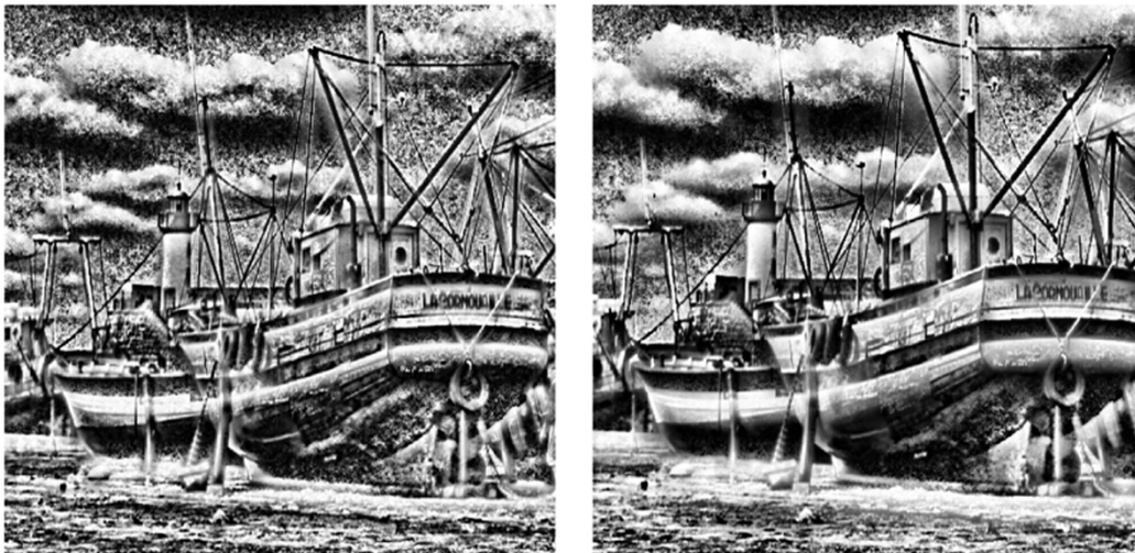
Fig. 4. Local histogram equalization: (left) 16 \times 16 window; (right) 32 \times 32 window.